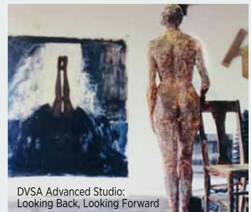
DVSA Advanced Studio: Looking Back, Looking Forward