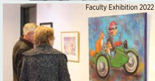
Faculty Exhibition 2022