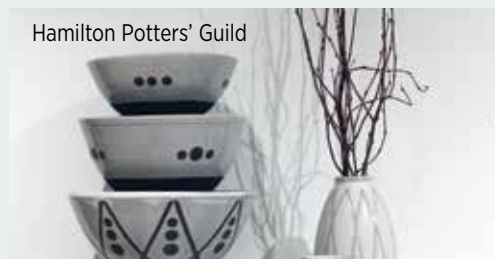
Hamilton Potters' Guild