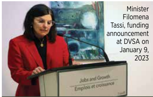
Minister Filomena Tassi, funding announcement at DVSA on January 9, 2023